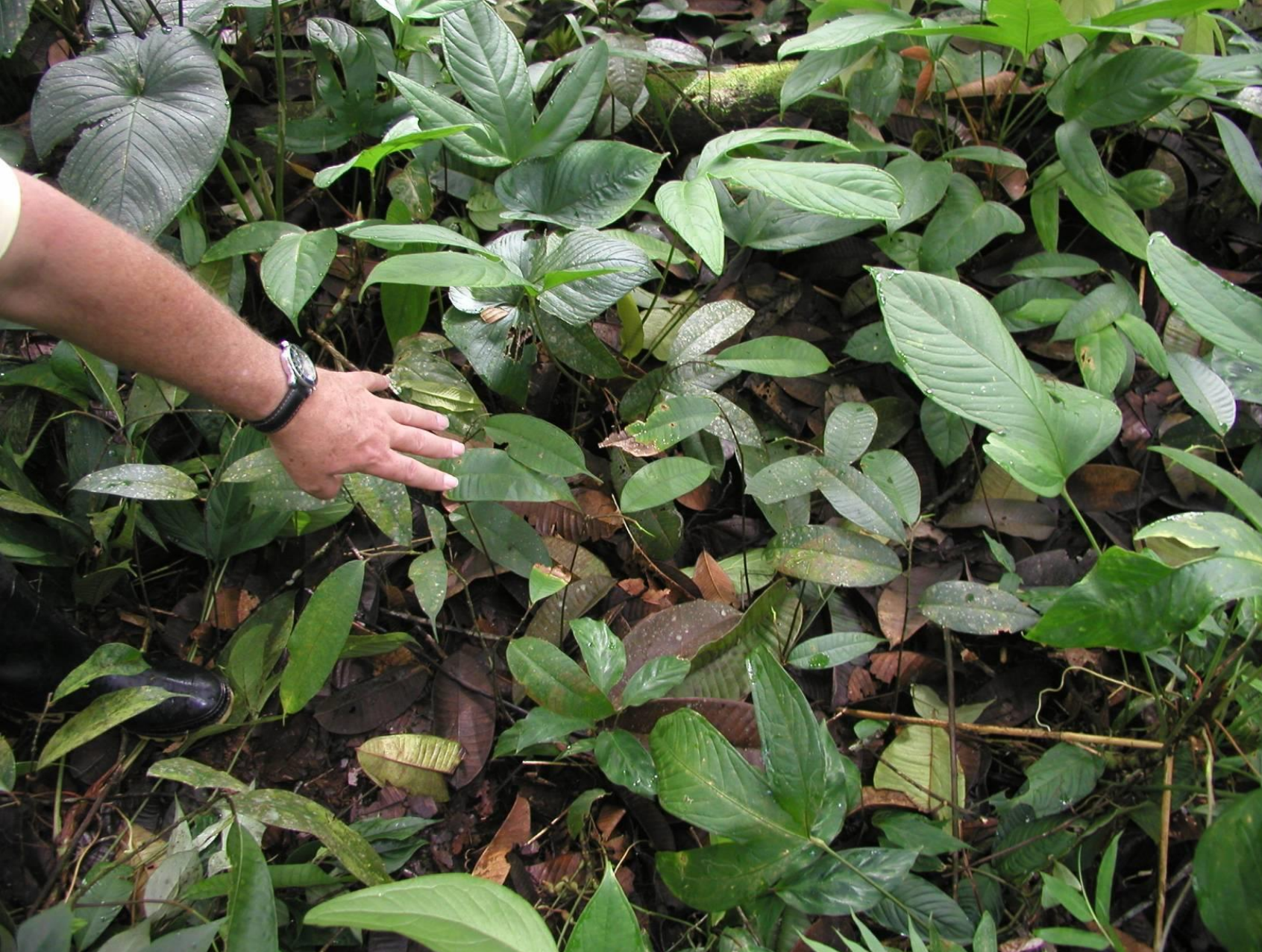
Natural regeneration of Brosimum utile